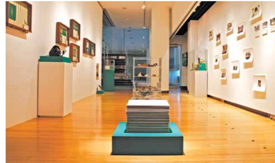
Students taking the Minor in Art History can attend classes within museum galleries

NUS students keen to learn more about the arts can now opt to pursue a Minor in Art History.