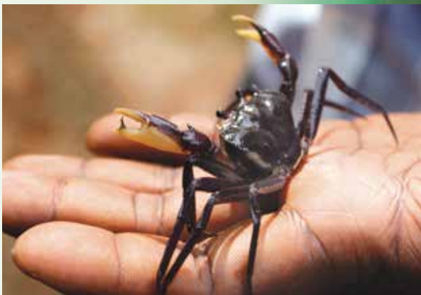
The crab has long legs which allow it to climb trees with dexterity