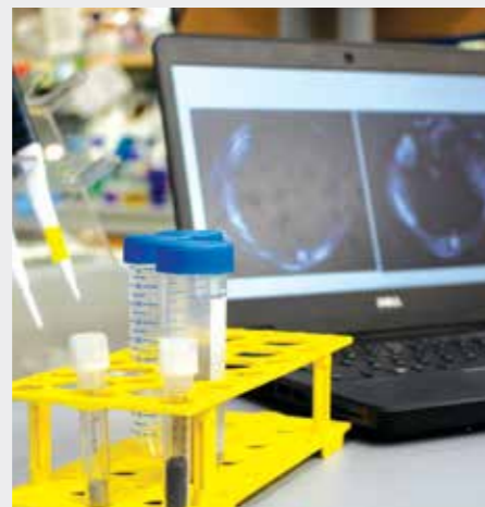
The novel contrast agent (grey solution in larger tube) was developed using nanodiamonds and provides clearer MRI images of liver tumours at lower dosages